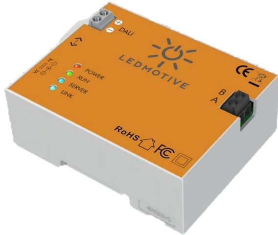
Figure 1. LIGHT HUB picture

The LIGHT HUB is designed for indoor applications only (IP20).